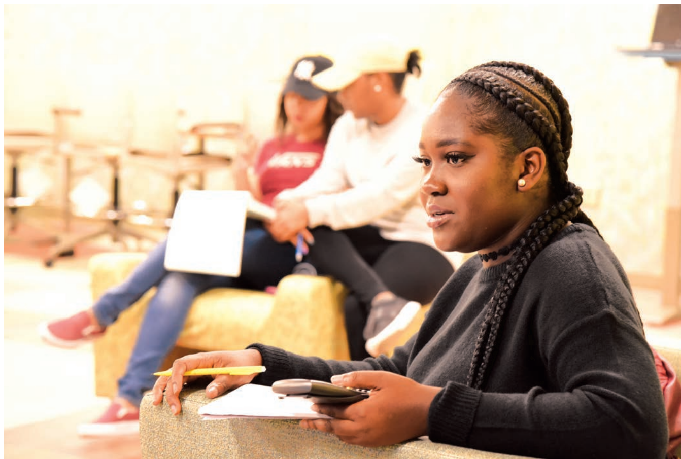
Student Research Center members in their newly renovated space.

The wait is over! Join the club and surround yourself with people who lift you higher.