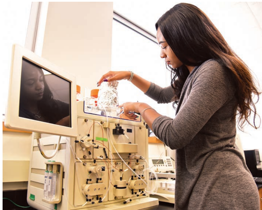
MSU student working with equipment that ASCEND has purchased for its Core Laboratory.

Coming together is a beginning; keeping together is progress; working together is success. —Henry Ford