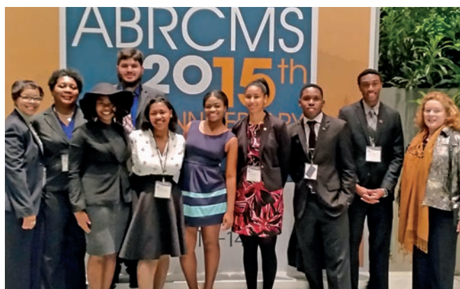
ASCEND Scholars and faculty attending ABRCMS 2015.