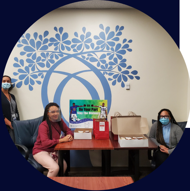
BHIPP special events are great ways to Network