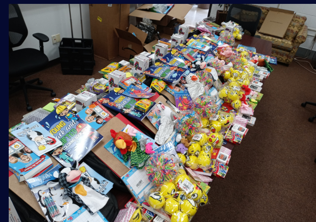
Each intern receives Pediatric theory books, Licensure prep books, and toys and games for their clients

Visit our website: https://www.morgan.edu/school_of_social_work/field_education/bhipp.html