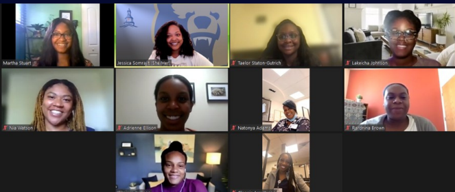
MSU BHIPP team and the 2021-2022 cohort meet virtually